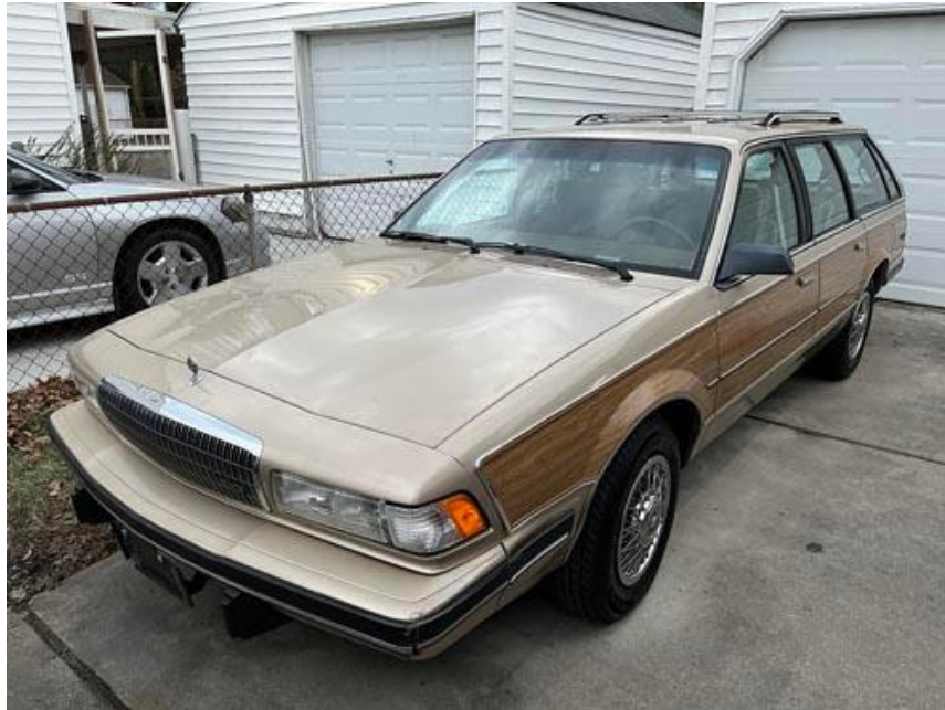
Bob Stein - 1993 Buick Century Custom Station Wagon