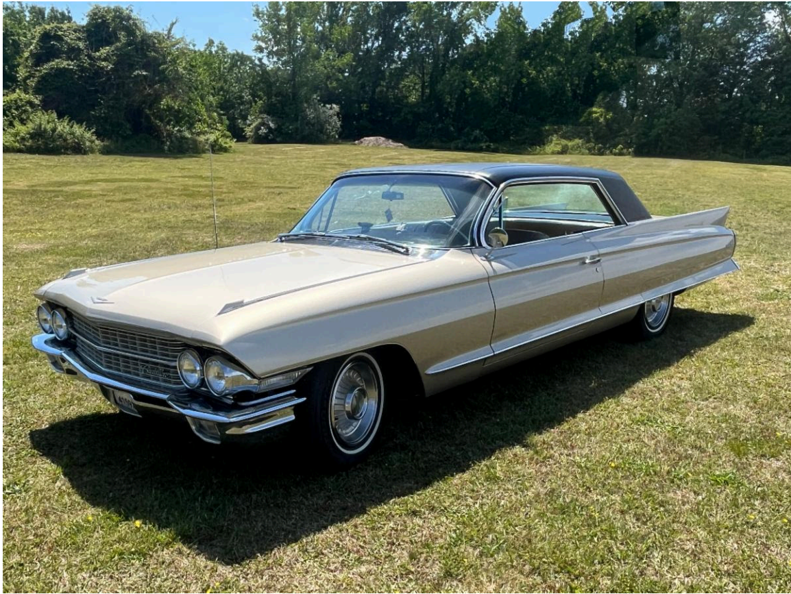
Bob Stein - 1962 Coupe deVille