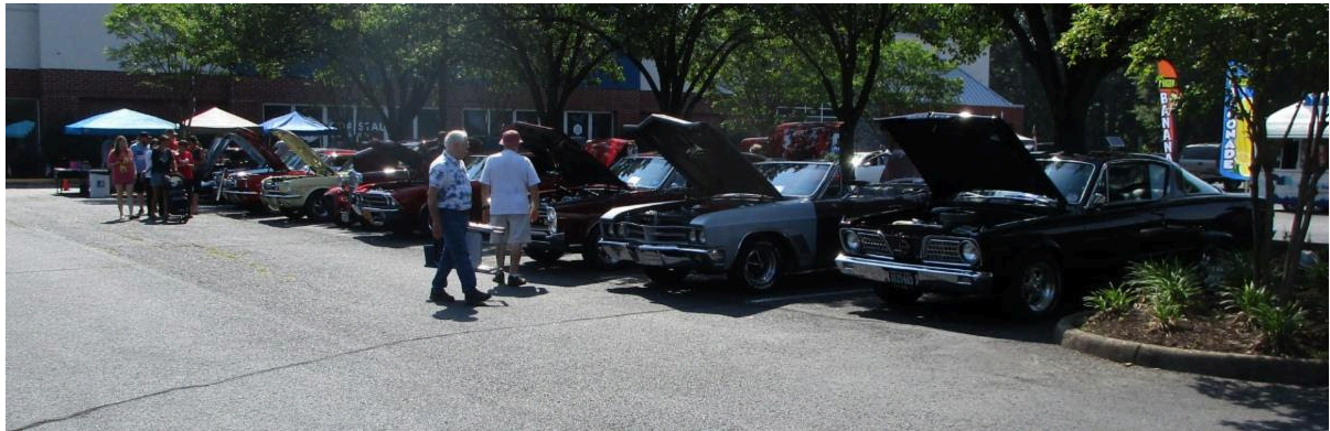
HVGPR Members Celebrate America's 250th